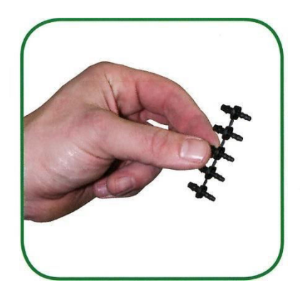
Grab the connection nozzles