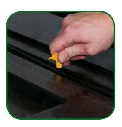
Using the holer puncher fit the connection nozzle into pierced holes