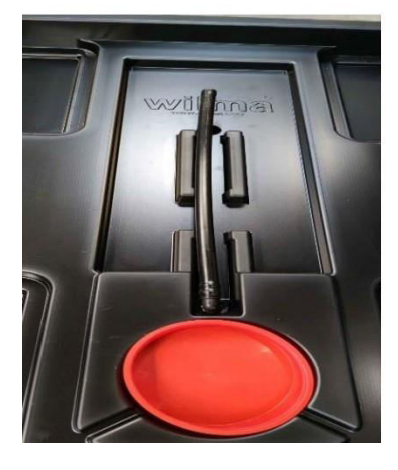
Place the hose in the centre of the tray