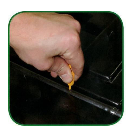
Pierce piping for fitting Cobra hosing in desired position