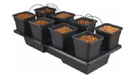
lead the Cobra hosing wilma pots placing in corresponding positions