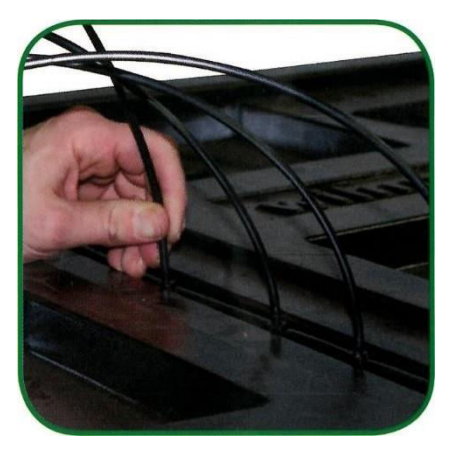
Continue to fit all Cobra hosing to nozzles along the piping